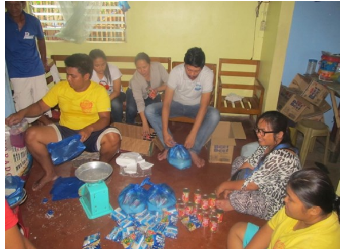
Staff & volunteers work together to pack the food into 500 parcels.