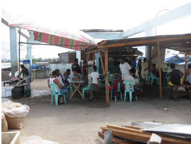
Uswag Kalgara MPC (photo of canteen)