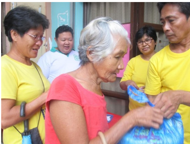
Distribution of the food parcels to both co-op members and the general community.