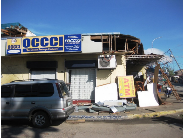
OCCCI (Kananga branch)