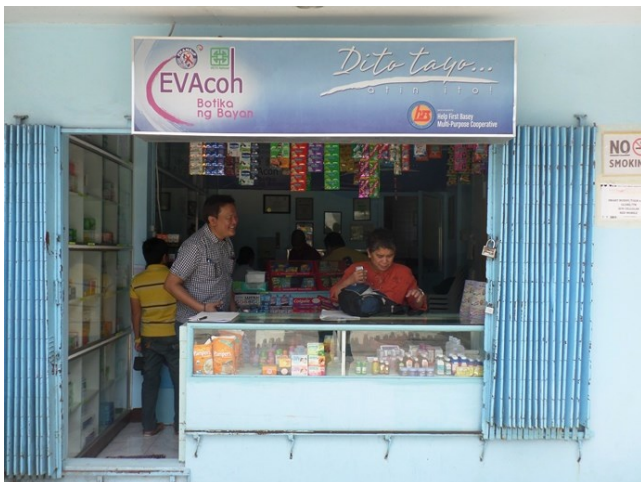
Help First Basey Multipurpose Cooperative: Pharmacy before the typhoon