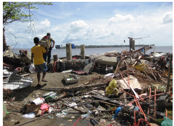
Help First Basey Multipurpose Cooperative: After the typhoon