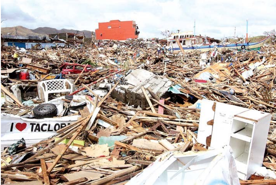
Typhoon Haiyan caused total destruction in many parts of Tacloban.