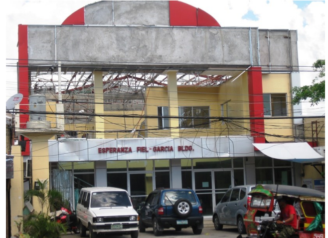
CFI Cooperative (Ormoc Branch)