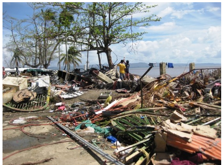
People search through the ruins for anything salvageable.