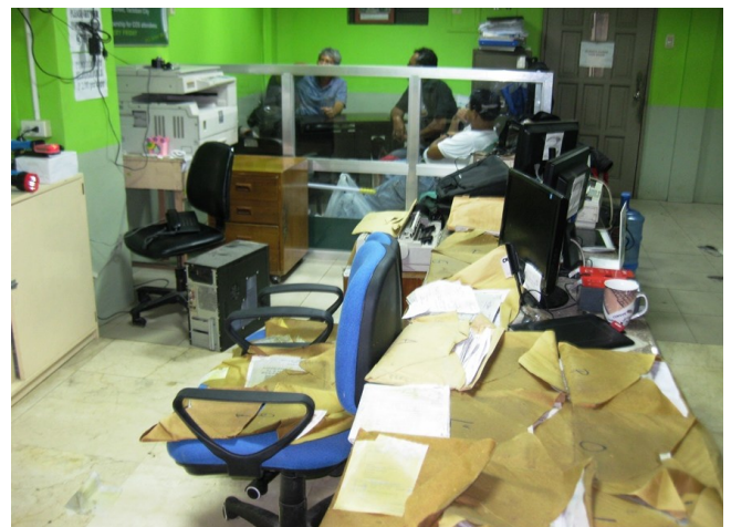
Perpetual Help Credit Cooperative (Tacloban):