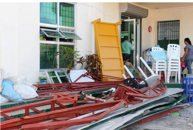
Kangara Multipurpose Cooperative