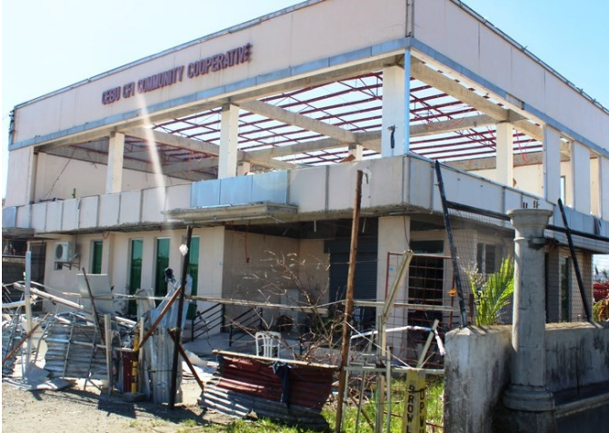
CFI Cooperative (Palo Branch)