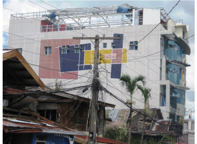
OCCCI (main office)