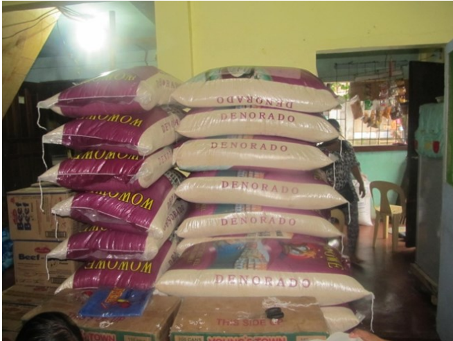
Goods delivered from the supplier.

On 29th December 2013, VICTO National and Nagkaisang Magsasaka nang Caibiran MPC (NAMACA MPC), in partnership with Foundation for Sustainable Development (FSSI), packed & distributed 500 food packs (rice, noodles, corned beef). 350 packs for co-op members, and 150 packs for the community of Caibiran, Biliran.