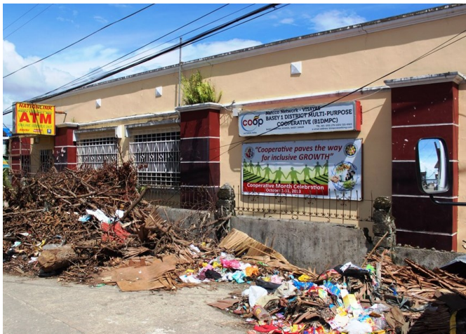
Basey 1 District MPC: